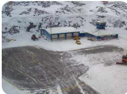
Video interface with onboard cameras