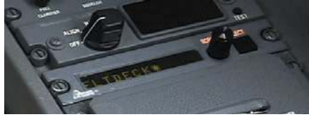
Flight Deck Controller